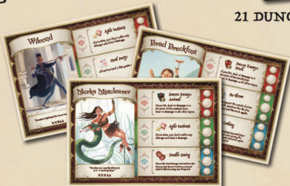
8 HERO SHEETS