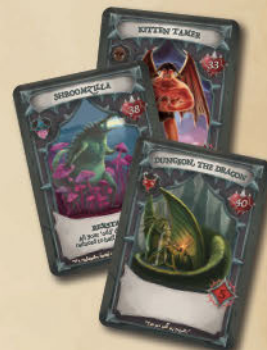
6 BOSS CARDS