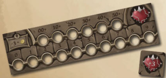
1 MONSTER LIFE TRACKER 1 DIFFICULTY MODE TOKEN