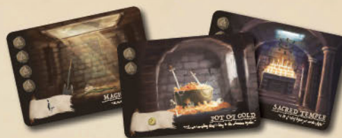
21 DUNGEON CARDS