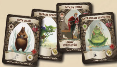
48 MONSTER CARDS