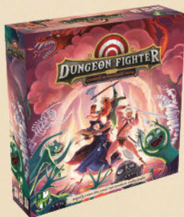
Chambers of Malevolent Magma