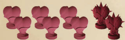
6 HERO LIFE MARKERS 2 MONSTER LIFE MARKERS