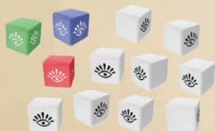
12 CUSTOMIZED DICE (3 COLORED HERO DICE + 9 WHITE BONUS DICE)