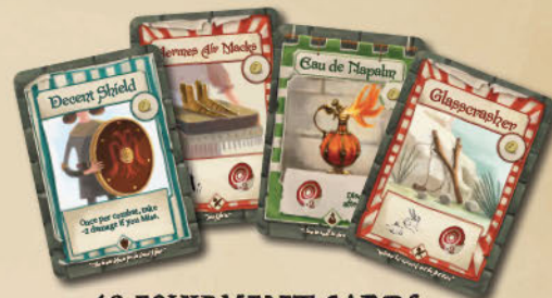
48 EQUIPMENT CARDS