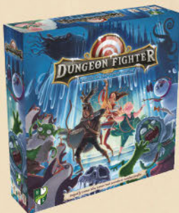
Castle of Freightening Frosts