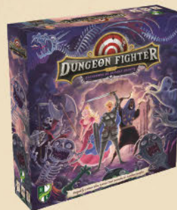
Catacombs of Gloomy Ghosts

DIVE INSIDE THIS FANTASTIC ADVENTUROUS WORLD WITH THE NEW DUNGEON FIGHTER ROLEPLAYING GAME: