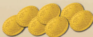
30 GOLD COINS