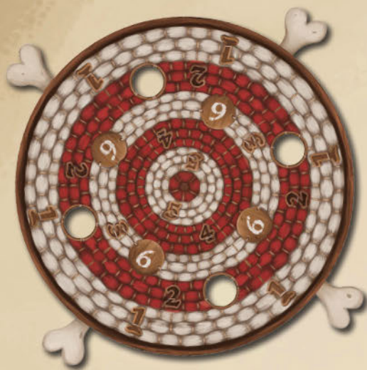
1 TARGET BOARD