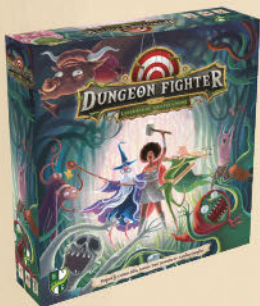
Labyrinth of Sinister Storms

TRY OUT NEW ADVENTURES. NEW HEROES, NEW MONSTERS, NEW DUNGEONS, NEW DICE, AND LOTS OF NEW GADGETS WITH CRAZY WAYS TO HIT OR MISS!