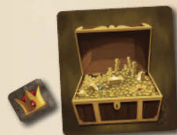
1 LEADER TOKEN 1 CHEST TILE